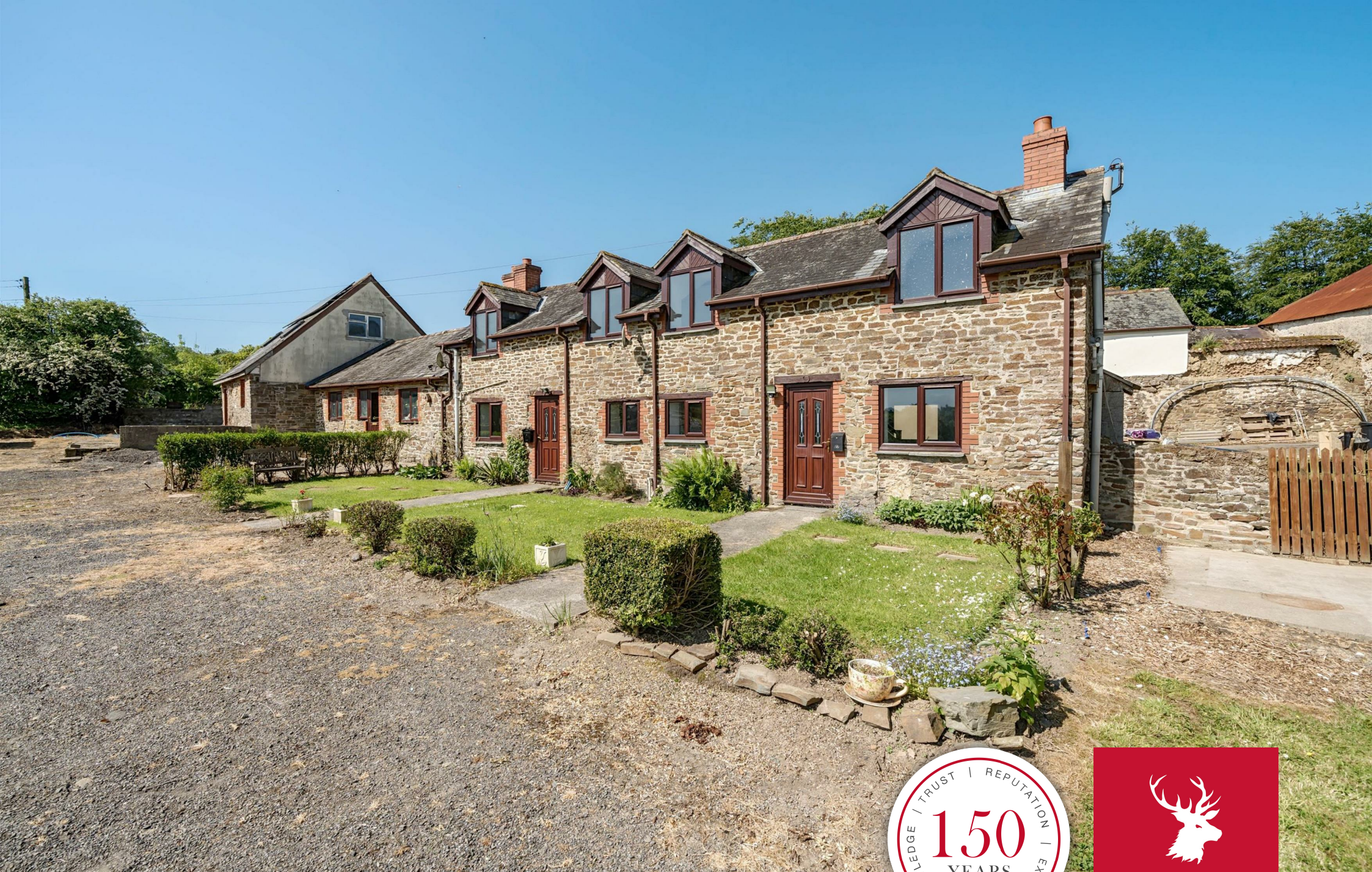
Lot 4 - Hedgehog Cottage