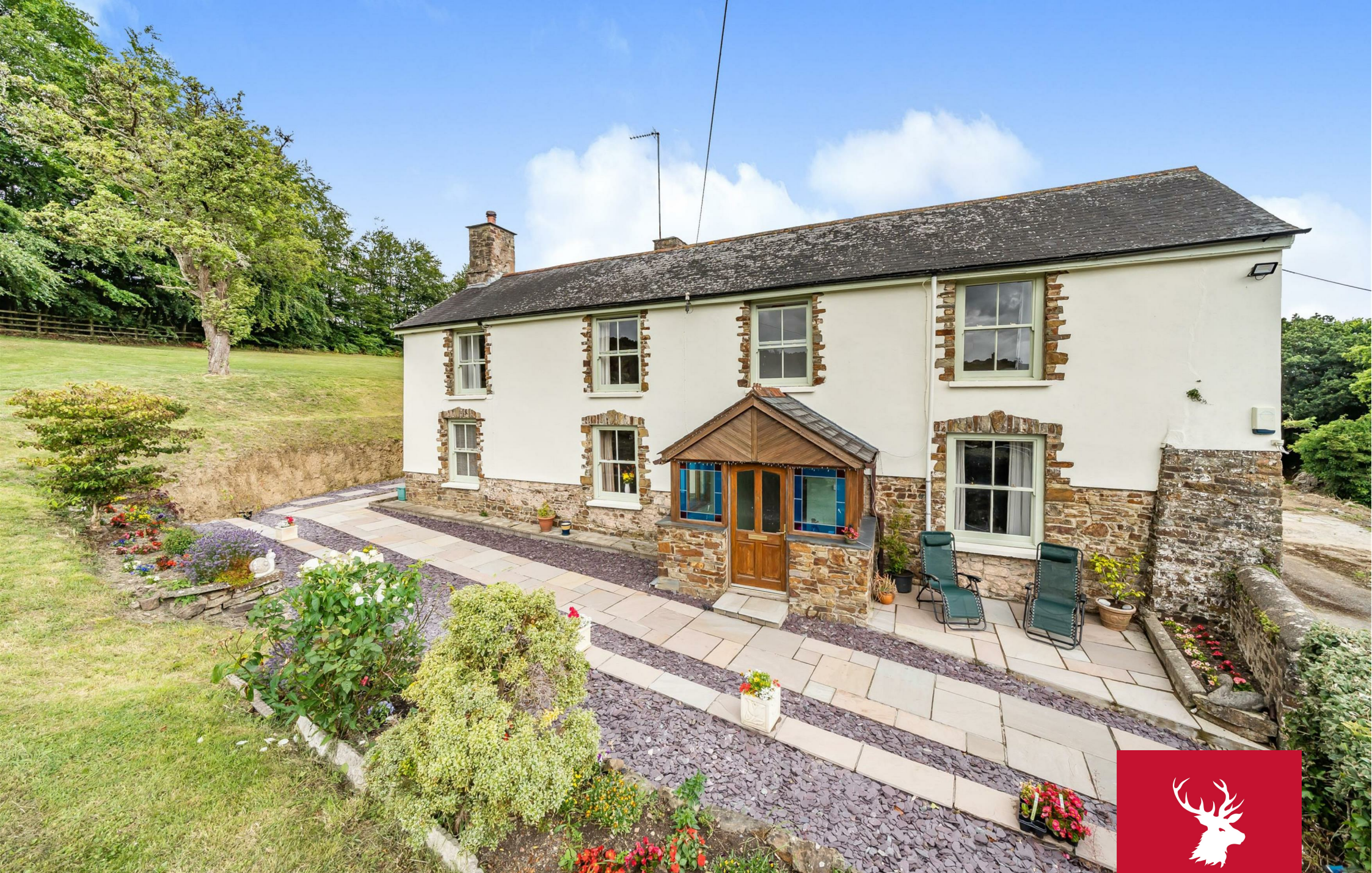
LOT 1 - Chantry Farmhouse & Period Barn