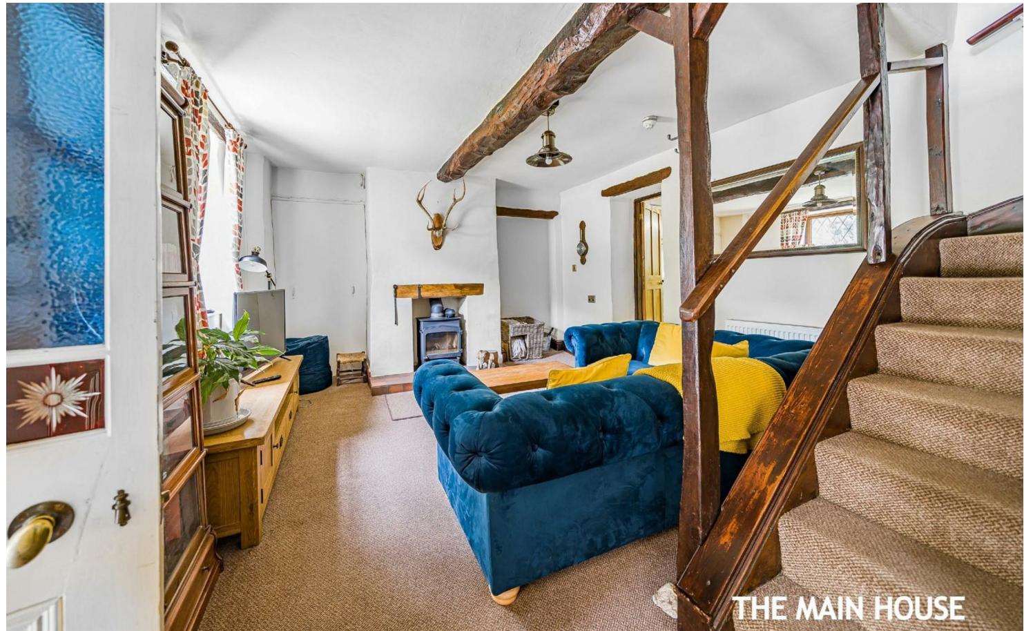
THE MAIN HOUSE