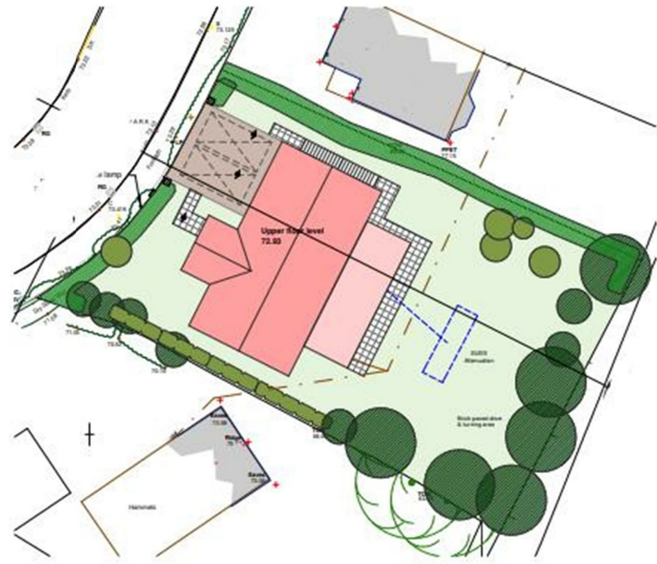
Site Plan 1 : 200