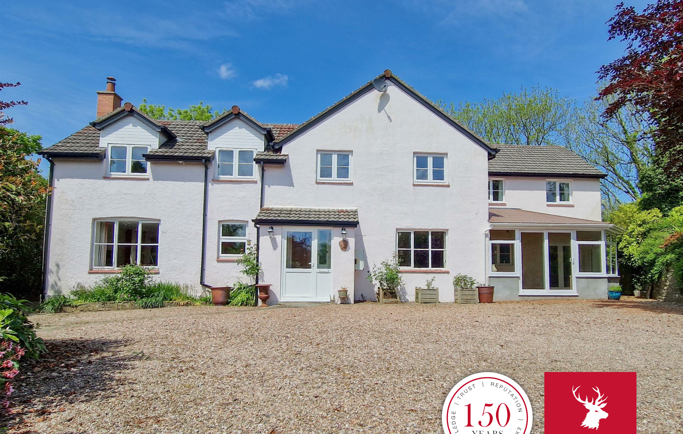
Beara Charter Farmhouse