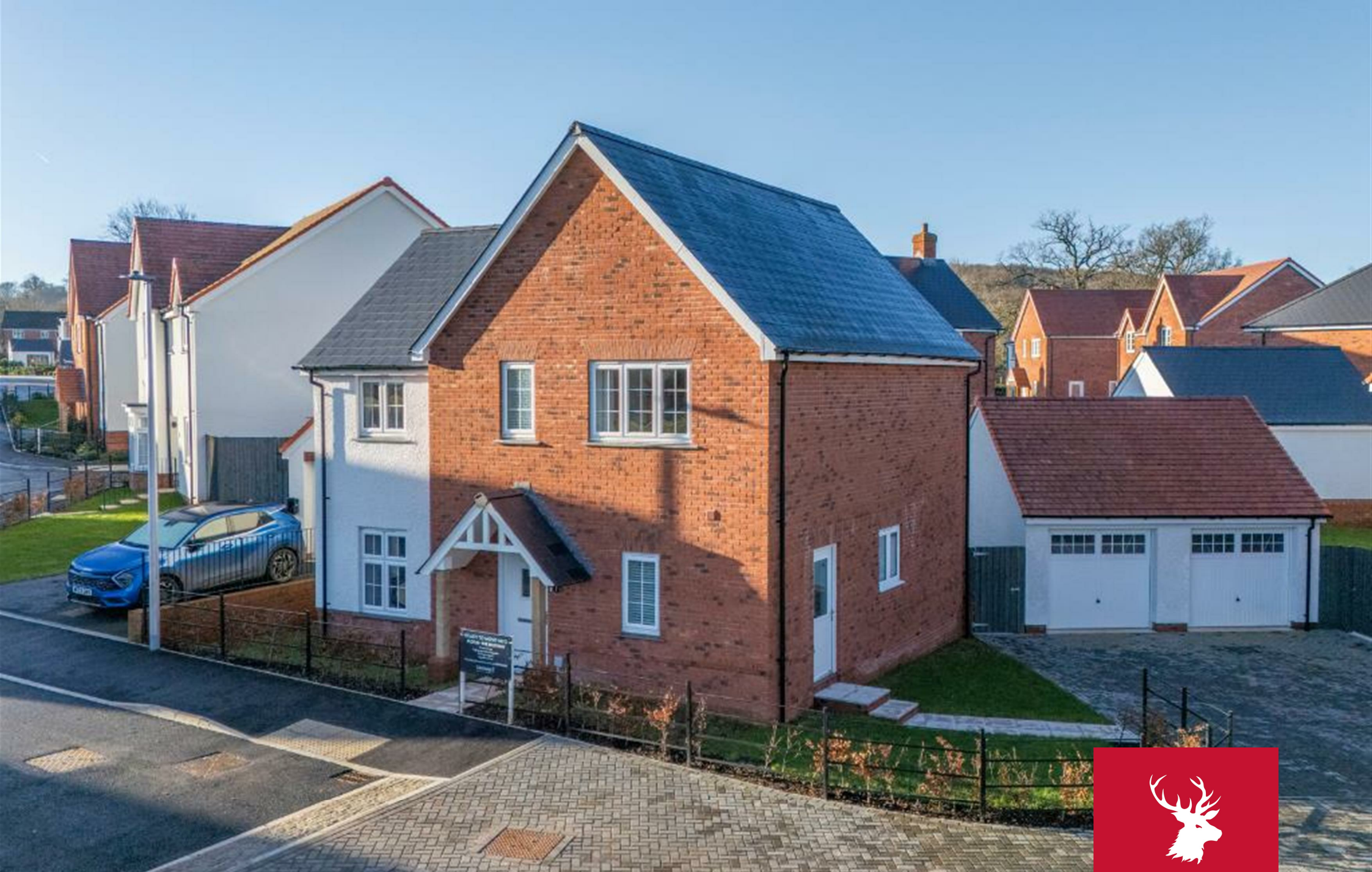
Plot 26 - The Belstone