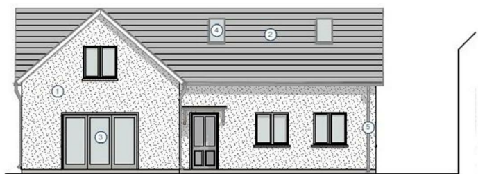
Proposed Front Elevation (South)