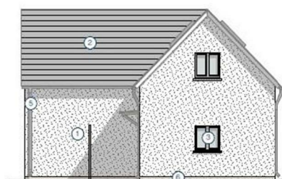
Proposed Side Elevation (East)