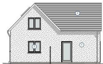
Proposed Side Elevation (West)