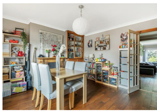
Town Centre 1 mile M5 (J26) 3 miles Taunton 8 miles