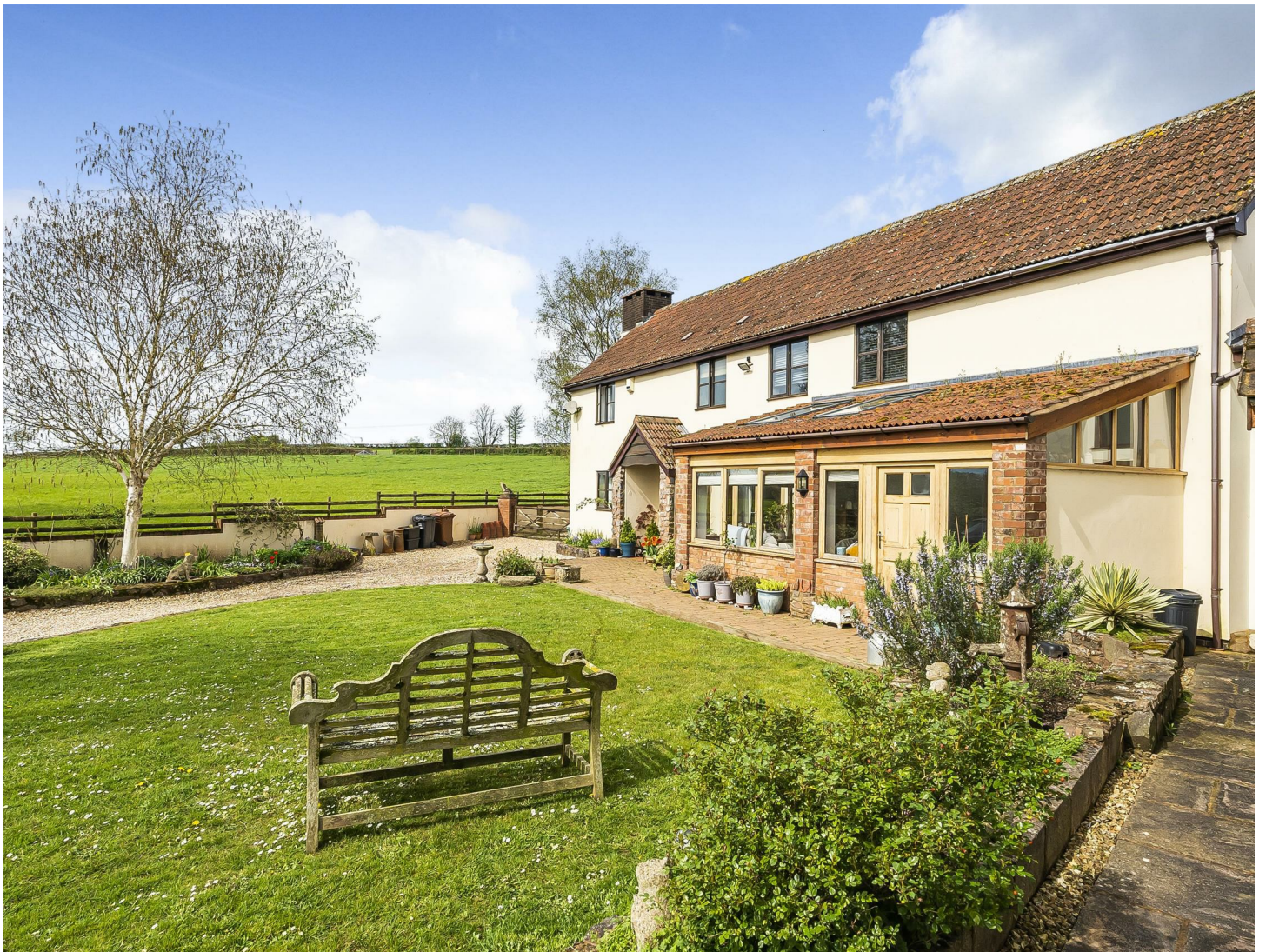
Ivy Farmhouse DUPE