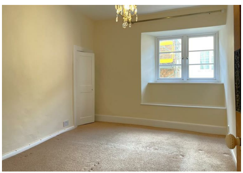
Wellington 7 miles Taunton 11 miles

Located in a Mews setting in the heart of Wiveliscombe is this character three bedroom cottage which has been recently redecorated inside.