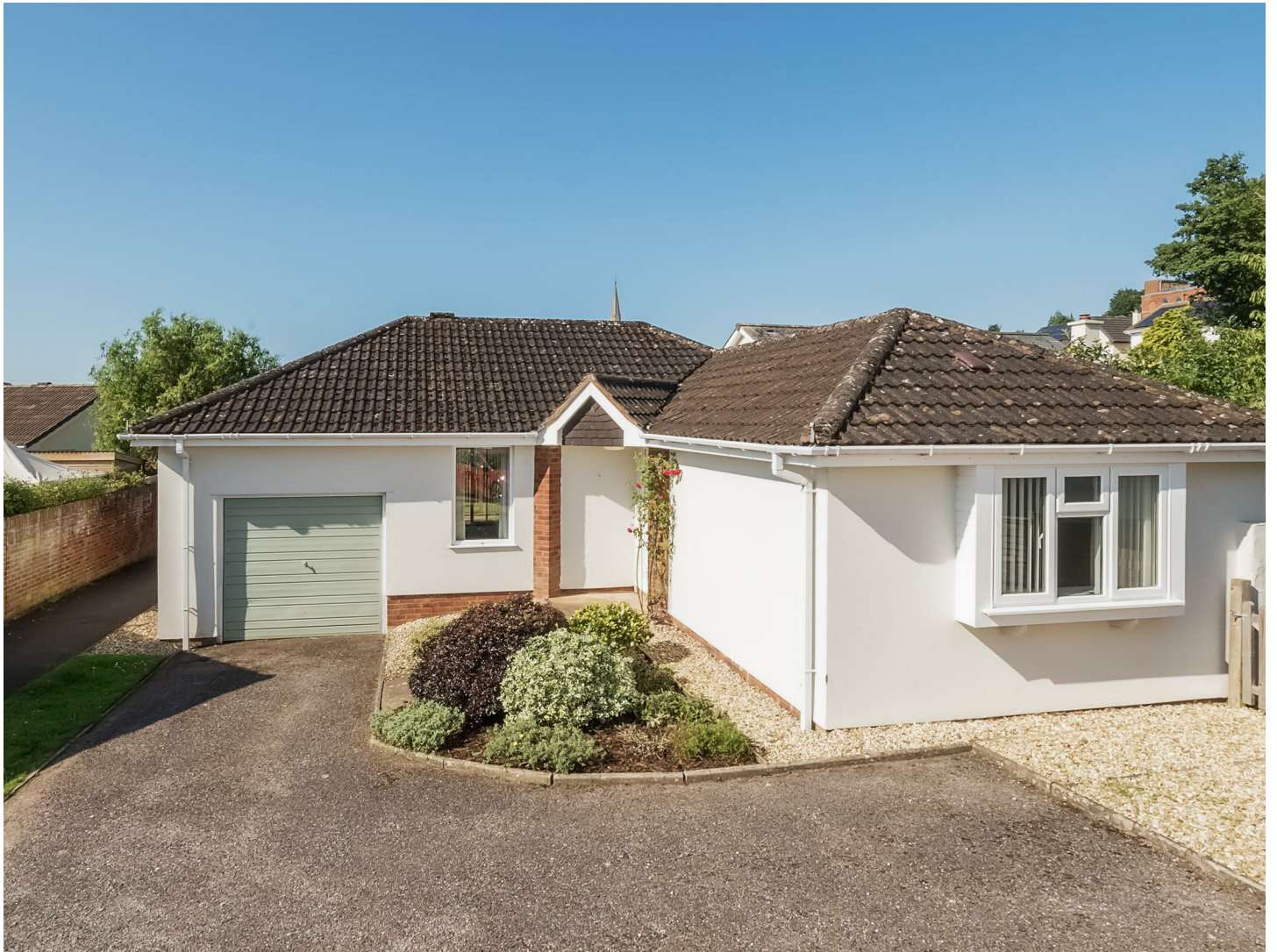
47 Meadow View