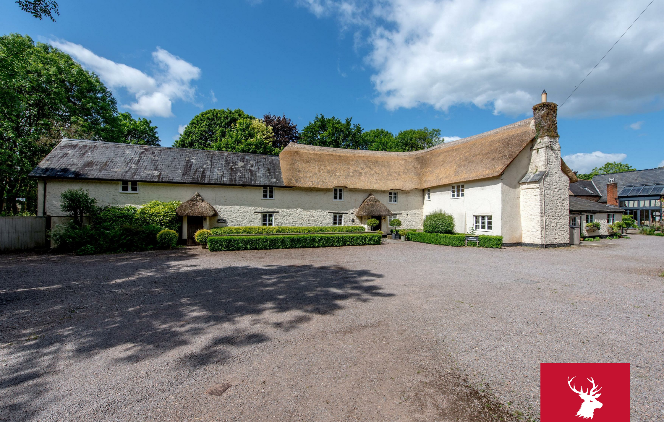
Rocknell Manor Farm