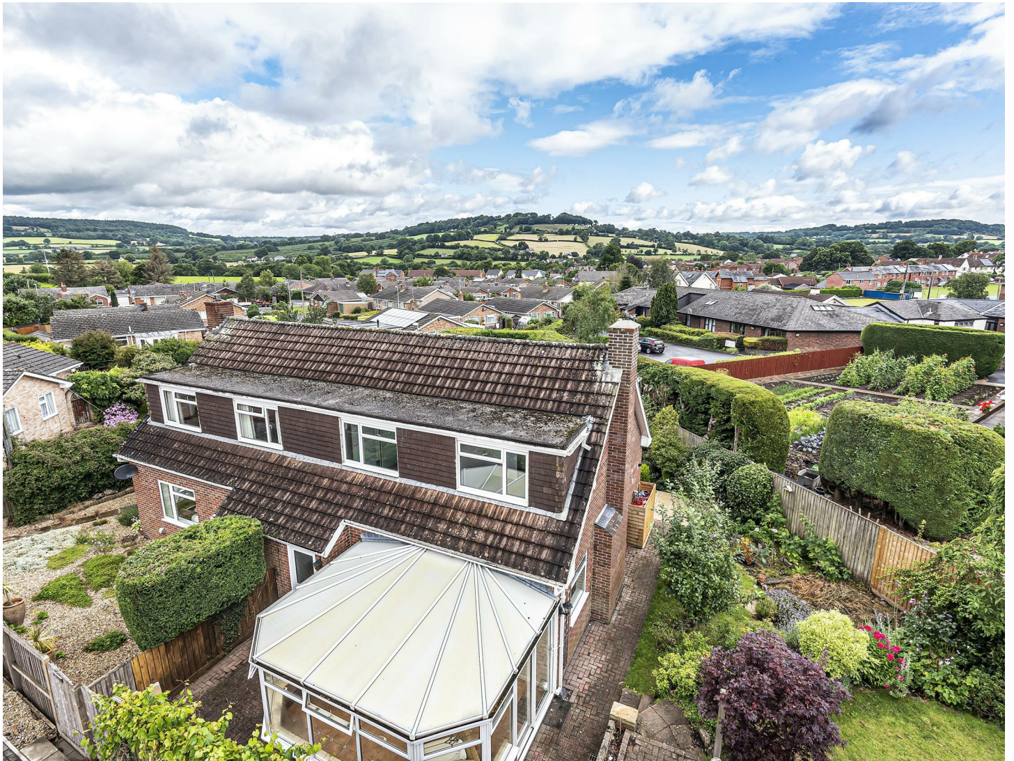
Perivale / Church View