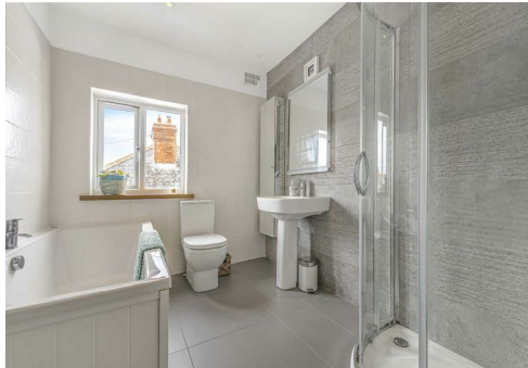
M5 (J26) 2 miles / Wellington 3.5 miles / Taunton 4 miles