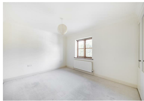
Wellington 3 miles Taunton 4 miles M5 (J26) 2.5 miles

A three bedroom detached house with garage and garden tucked away in the heart of this sought after village.