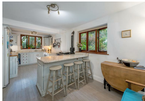
Taunton - 8 Miles, Wellington - 3 Miles, M5 (J26) 4 miles