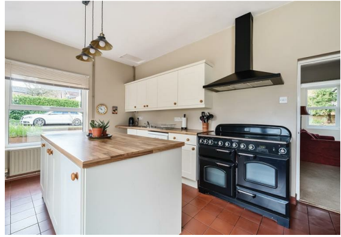
Town Centre 150m M5 (J26) 2 miles Taunton 7 miles

A well appointed period house close to Wellington School with extensive parking, garage and gardens.