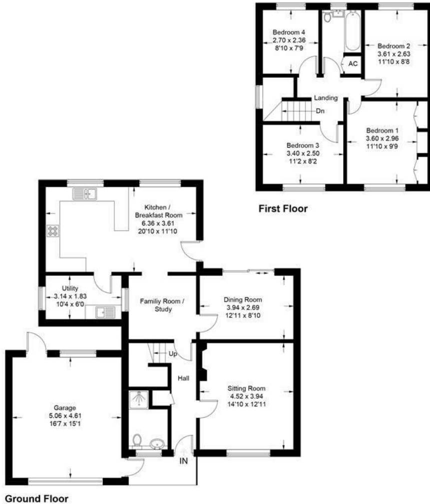
Illustration for identification purposes only, measurements are approximate, not to scale. floorplansUsketch.com © (ID931268)

Approximate Gross Internal Area = 133.0 sq m / 1431 sq ft Garage = 23.7 sq m / 255 sq ft Total = 156.7 sq m / 1686 sq ft