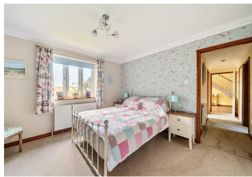
Wellington 4.4 miles. Hemyock 2.1 miles. M5 (J26) 6.3 miles.