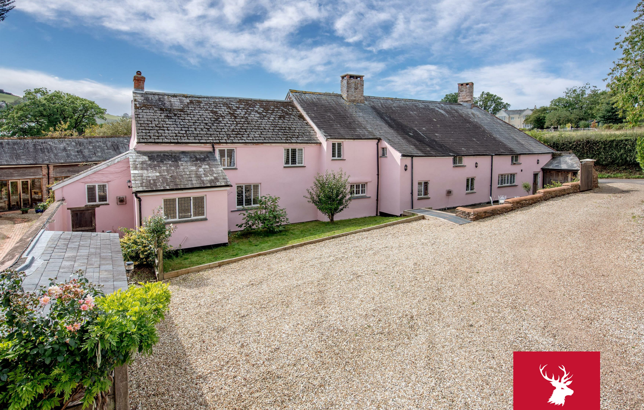
Appley Court Farm