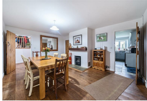
Wellington 3.5 miles M5 (J26) 5 miles Taunton 10 miles

A conveniently located detached three bedroom barn conversion set within gardens with double garage, stable block and adjoining land extending to approximately 2.7 acres