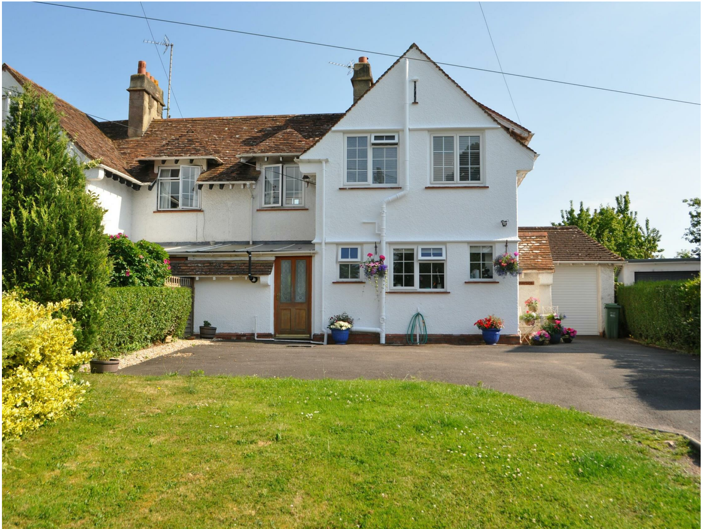
3 Wayside Cottages