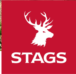
The Old Vicarage