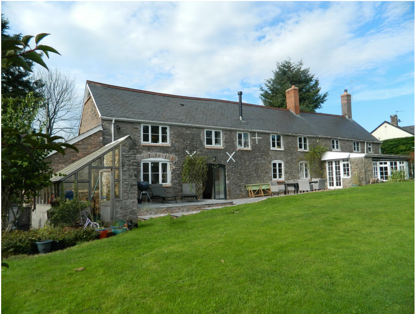
Frog Lane Farm