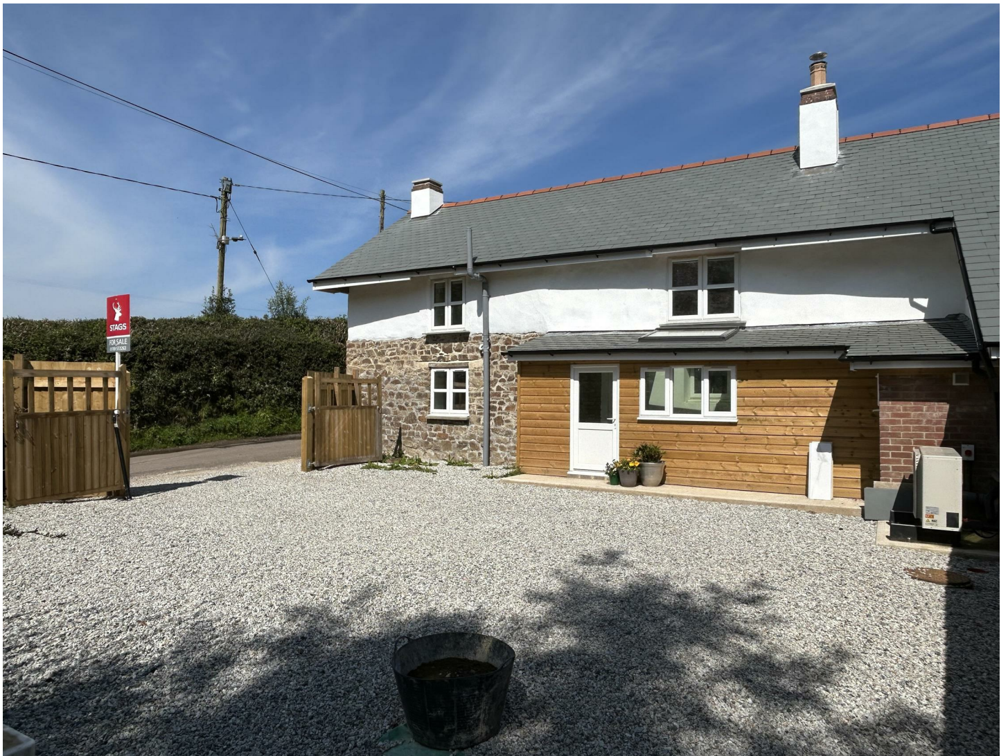
2 Hayne Farm Cottages