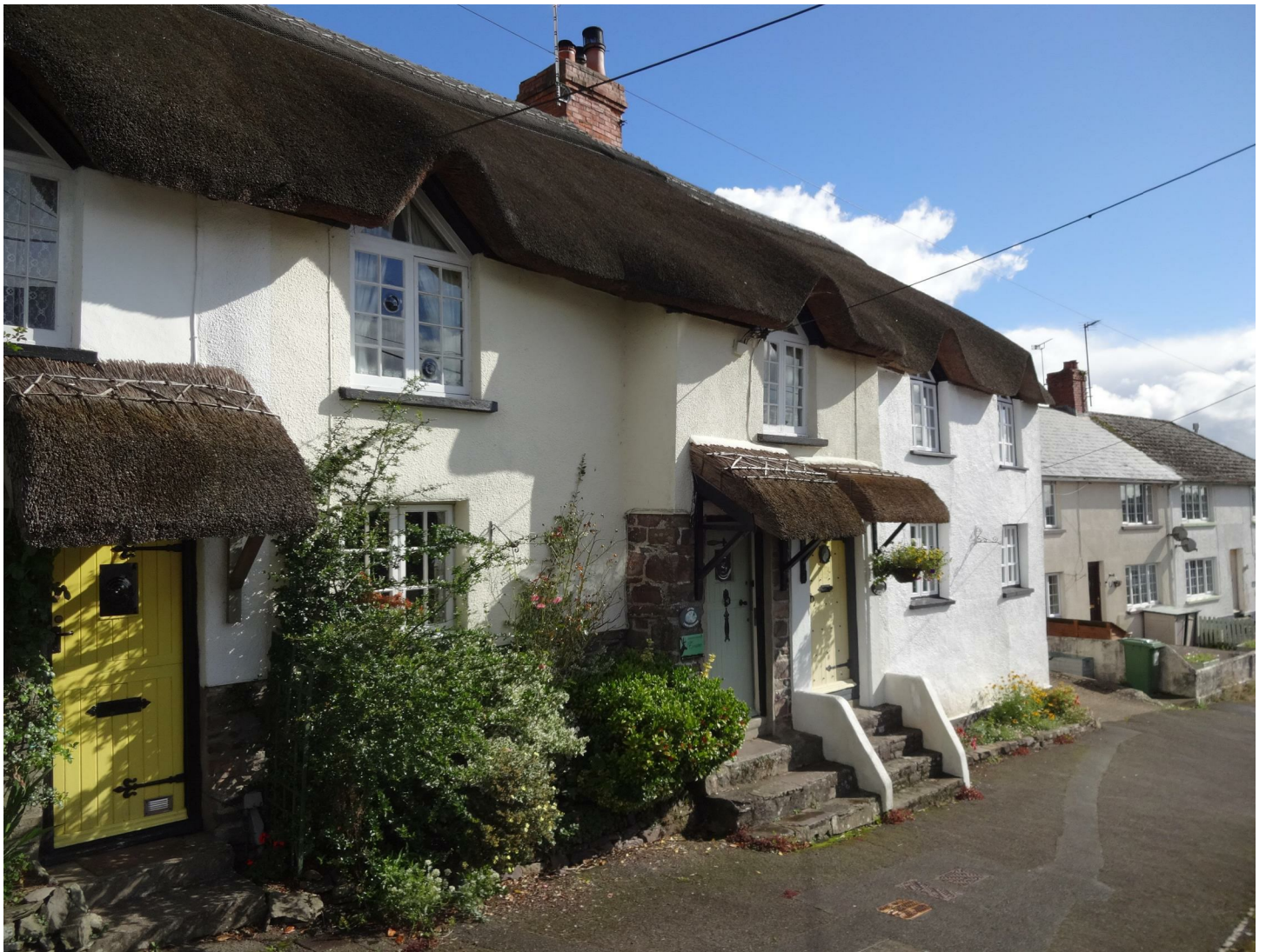
2 Higher Locks Cottage