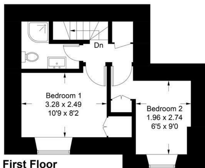
Illustration for identification purposes only, measurements are approximate, not to scale. floorplansUsketch.com © (ID1128064)

IMPORTANT: Stags gives notice that: 1. These particulars are a general guide to the description of the property and are not to be relied upon for any purpose. 2. These particulars do not constitute part of an offer or contract. 3. We have not carried out a structural survey and the services, appliances and fittings have not been tested or assessed. Purchasers must satisfy themselves. 4. All photographs, measurements, floorplans and distances referred to are given as a guide only. 5. It should not be assumed that the property has all necessary planning, building regulation or other consents. 6. Whilst we have tried to describe the property as accurately as possible, if there is anything you have particular concerns over or sensitivities to, or would like further information about, please ask prior to arranging a viewing.