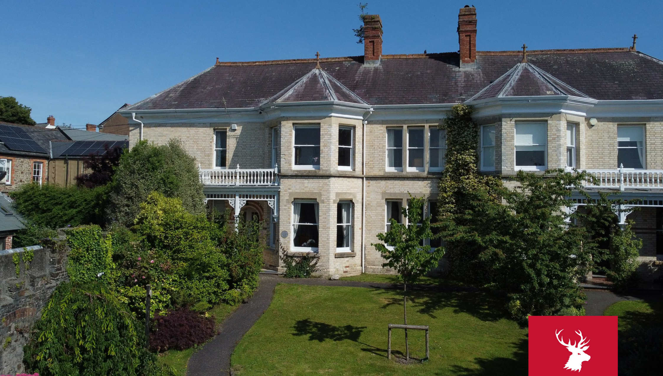
Ashley House & Building Plot