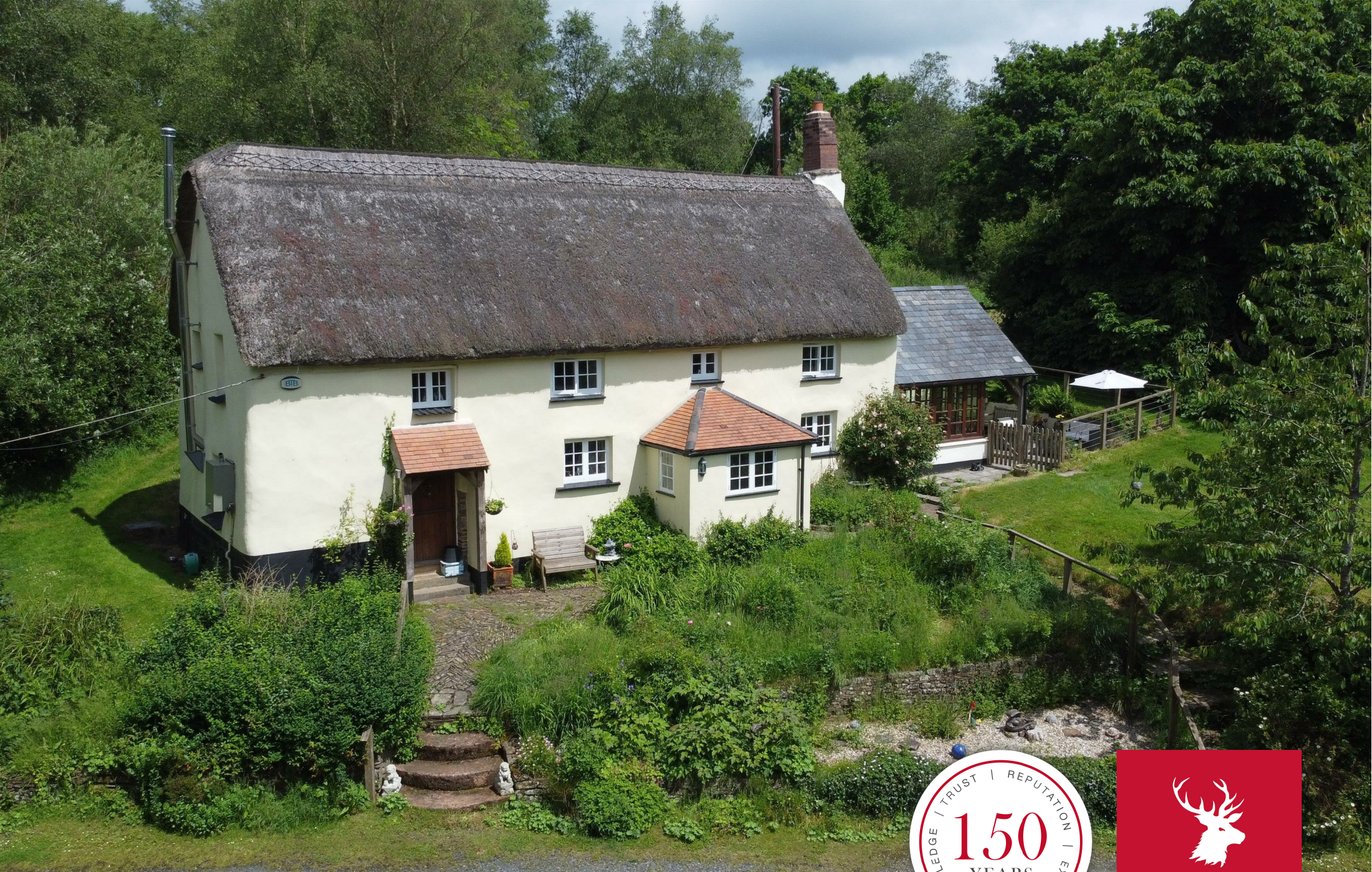
West Gosland Down