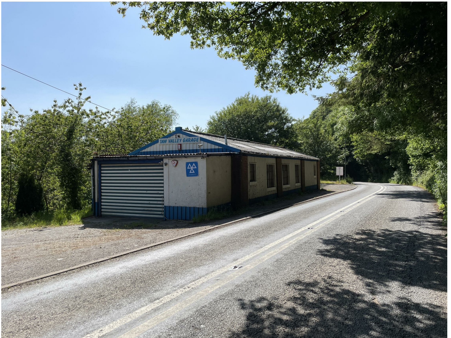
Taw Valley Garage & Otter Croft