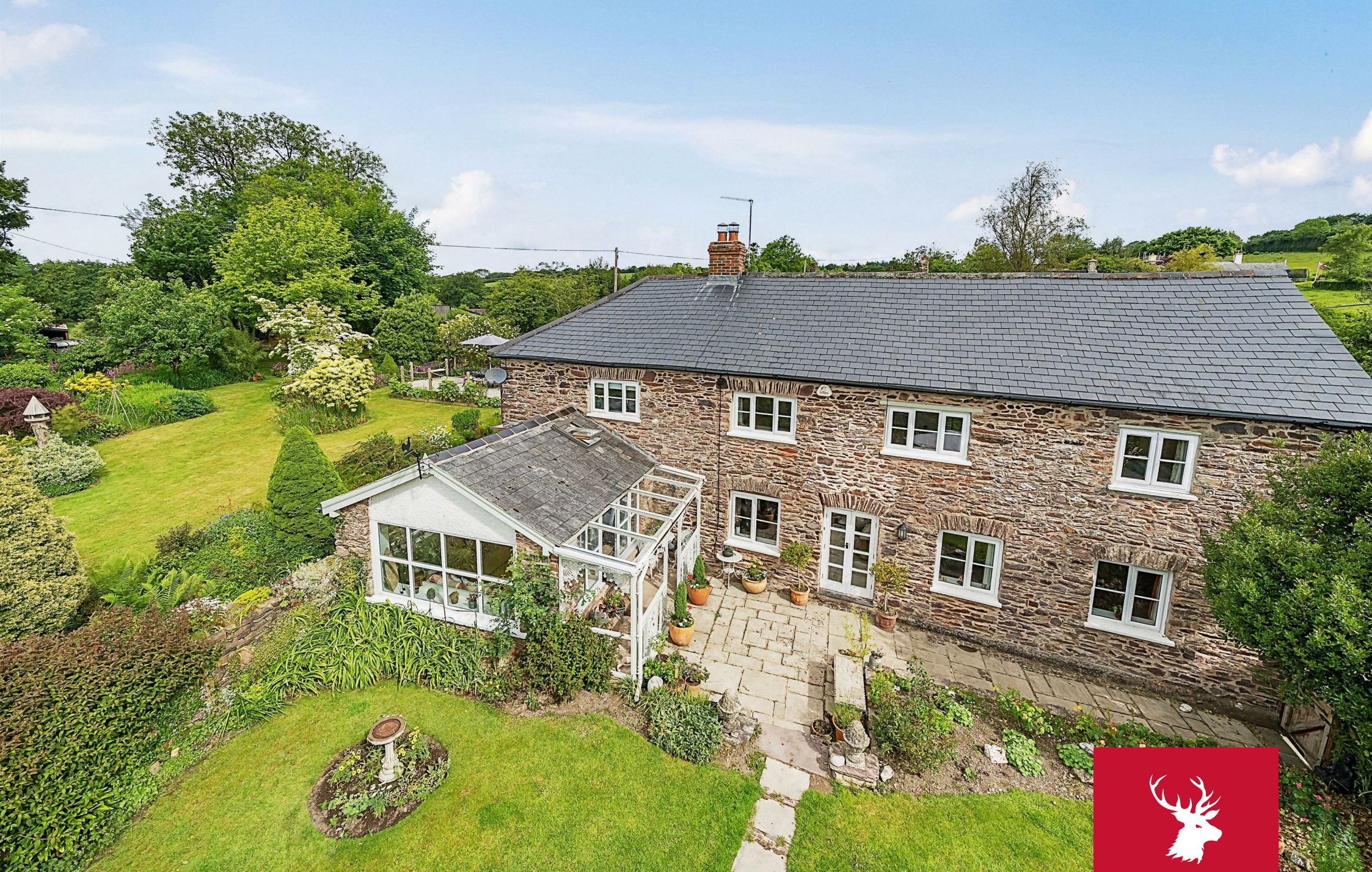
The Old Post House