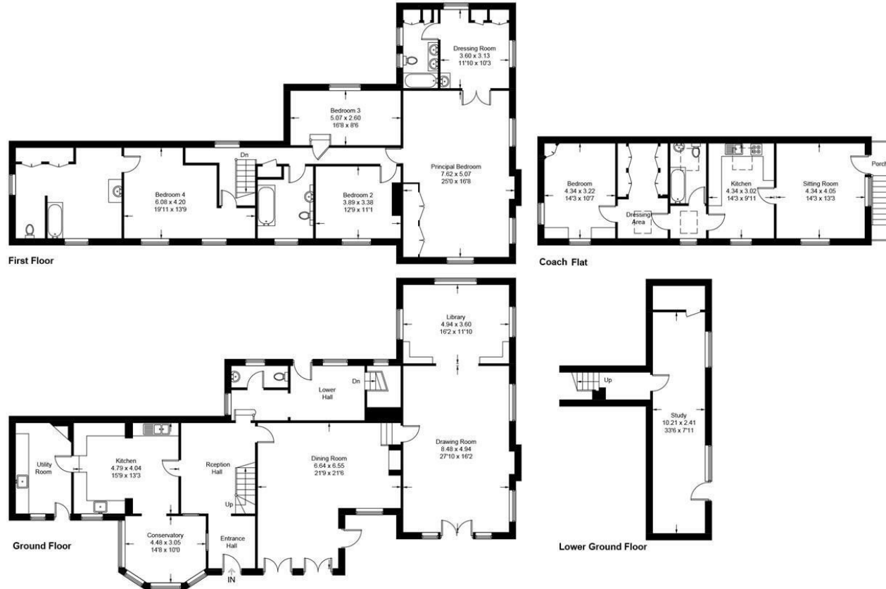
Illustration for identification purposes only, measurements are approximate, not to scale. Fourlabs.co © (ID1171587)