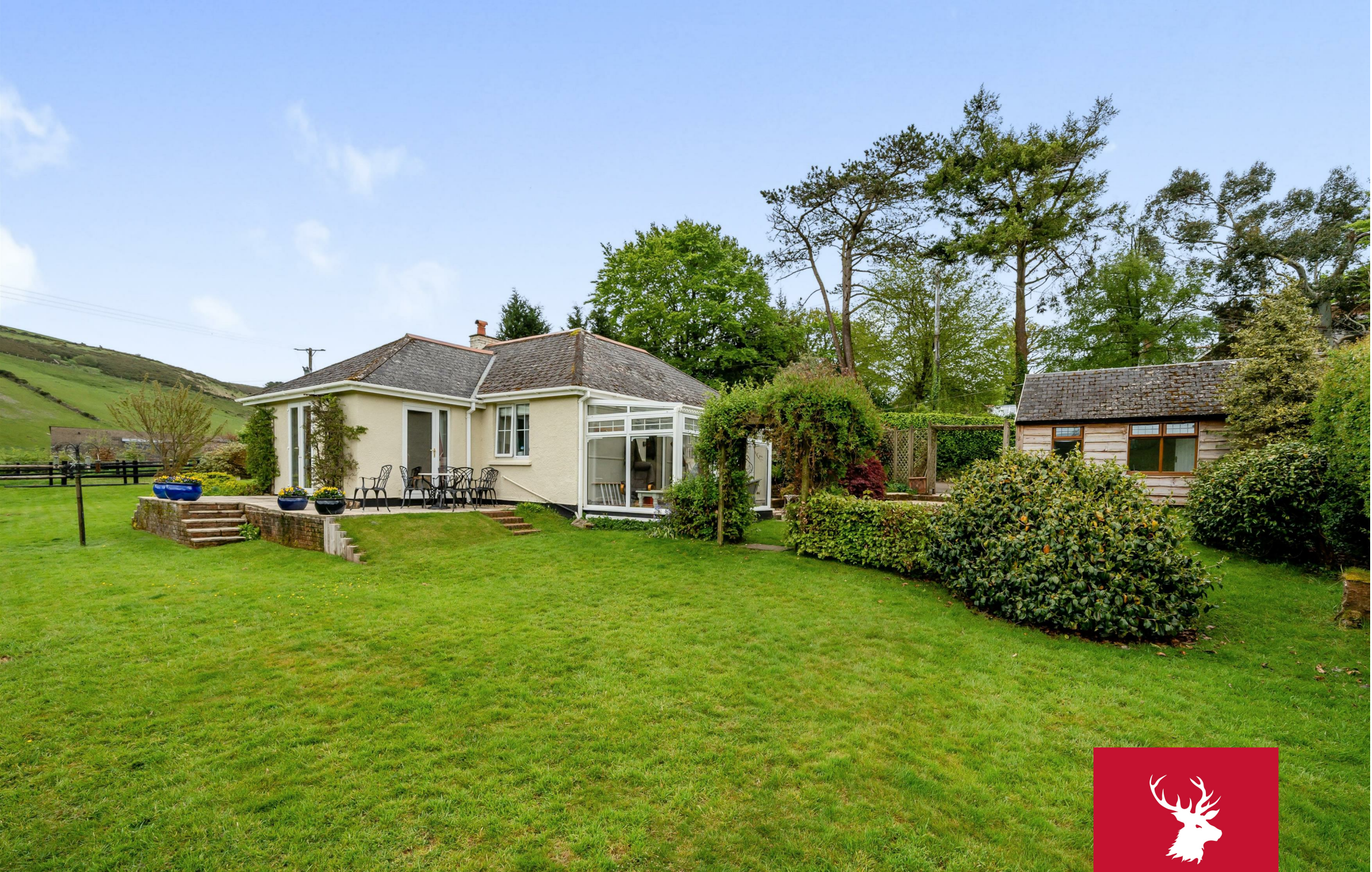
Oare Water Cottage