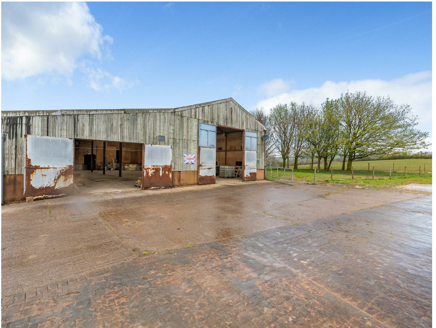
Barn at New Park Farm