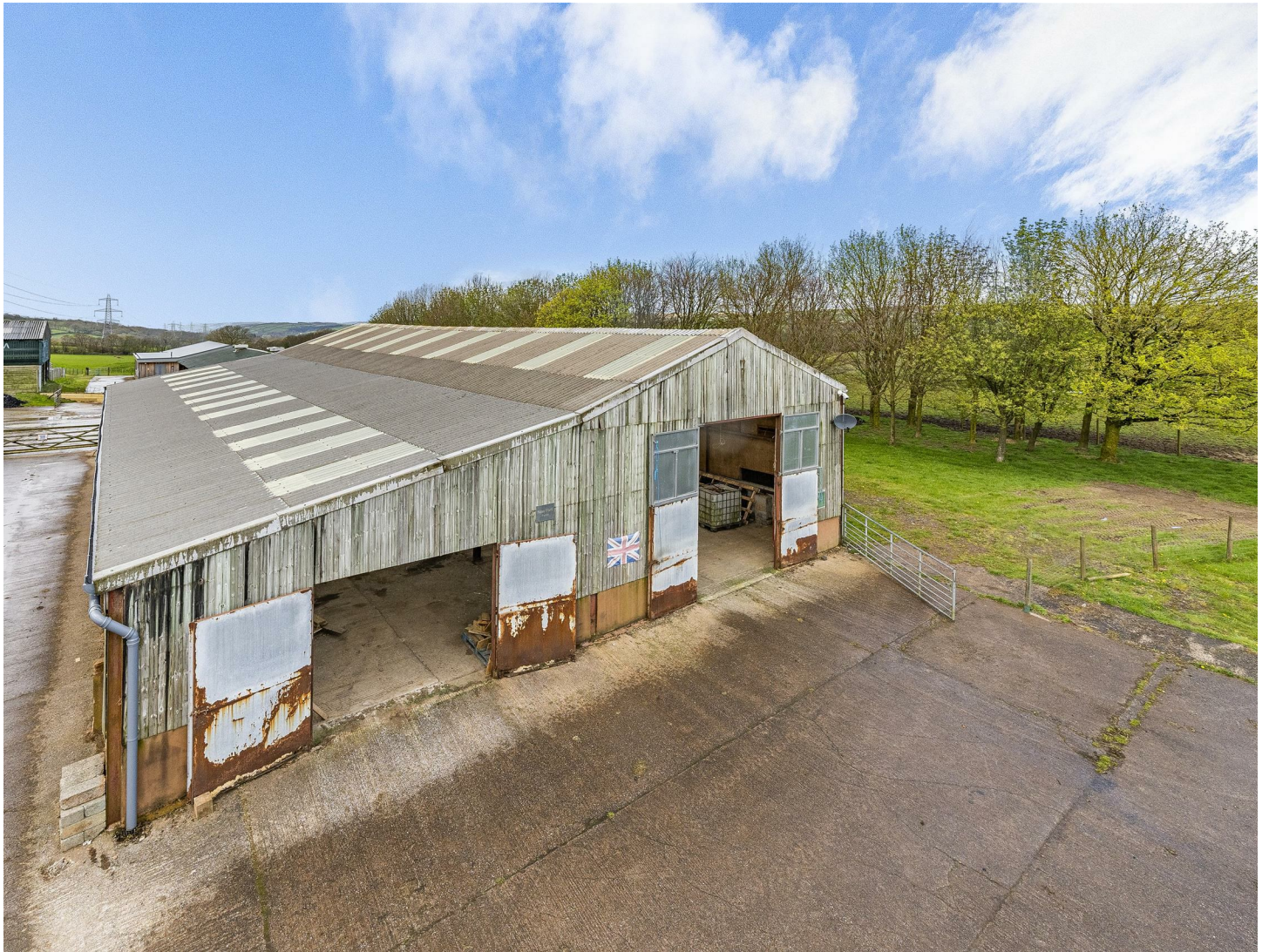
Barn at New Park Farm