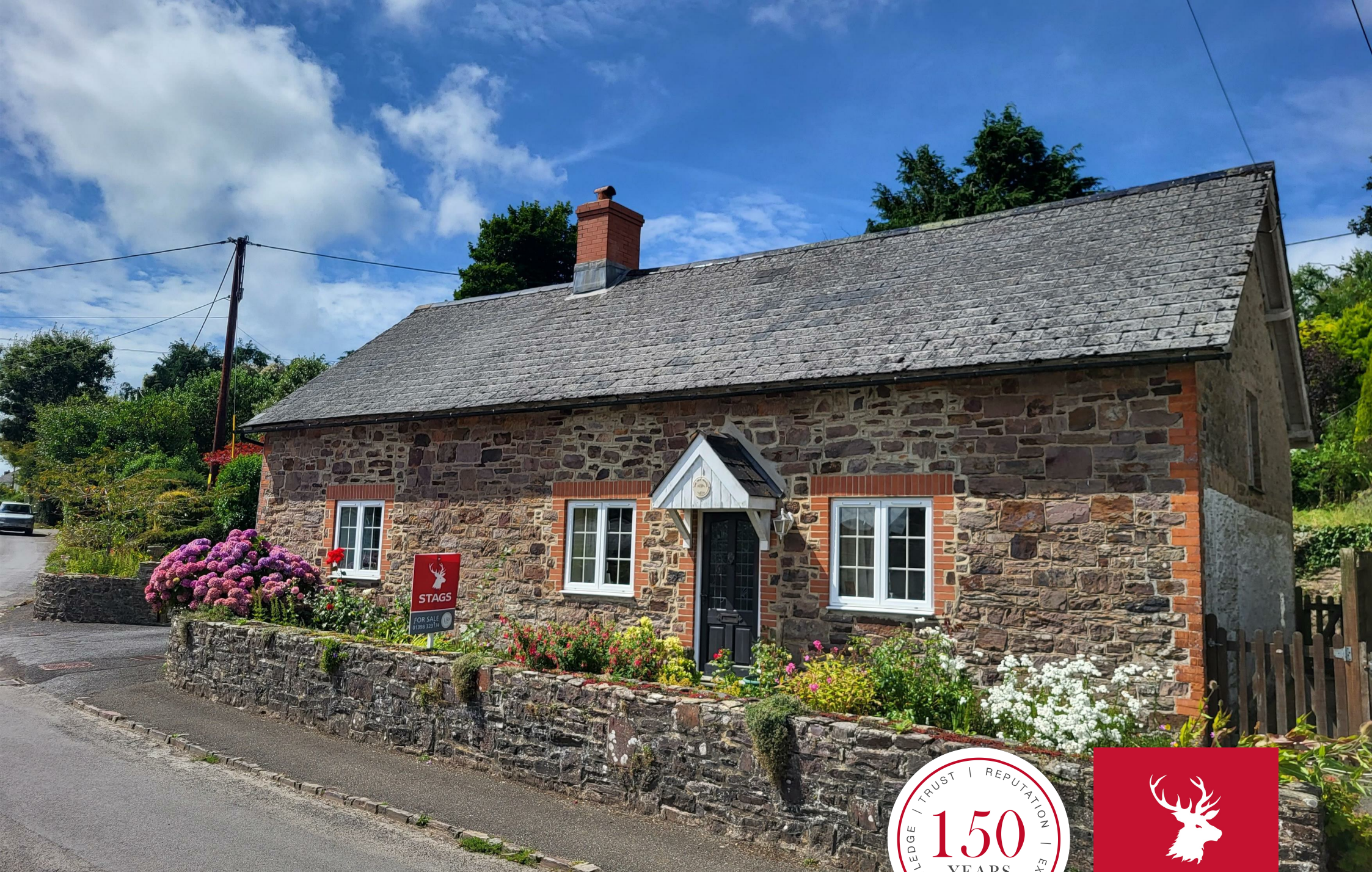
The Old School