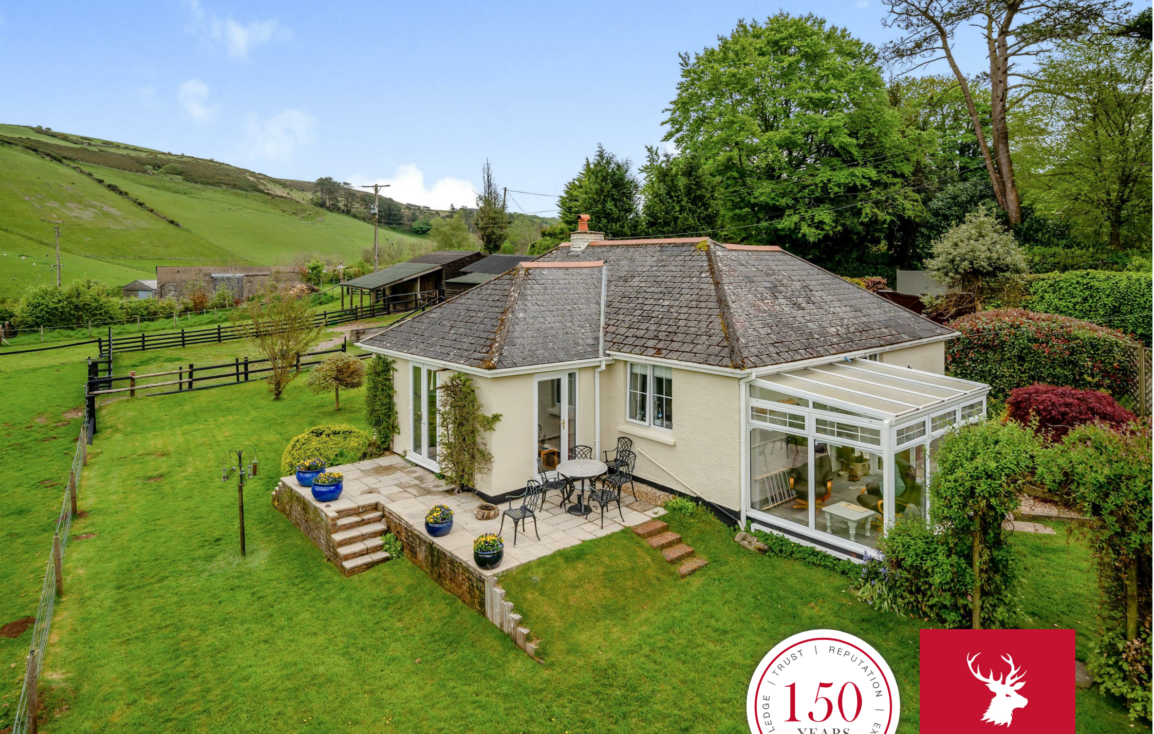
Oare Water Cottage