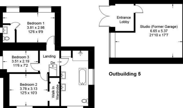
Illustration for identification purposes only, measurements are approximate, not to scale. floorplansUsketch.com © (ID1061991)