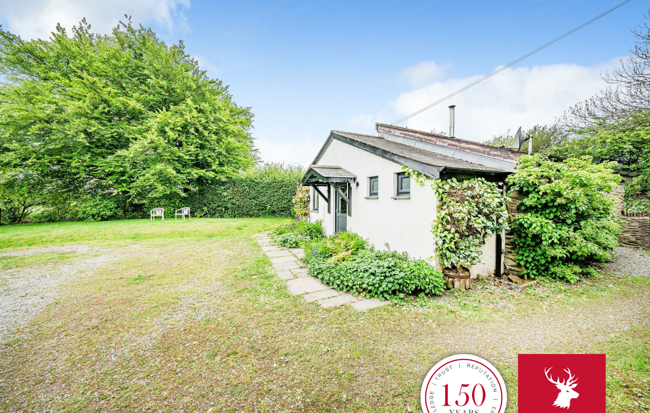
Woolcotts Cross Cottage