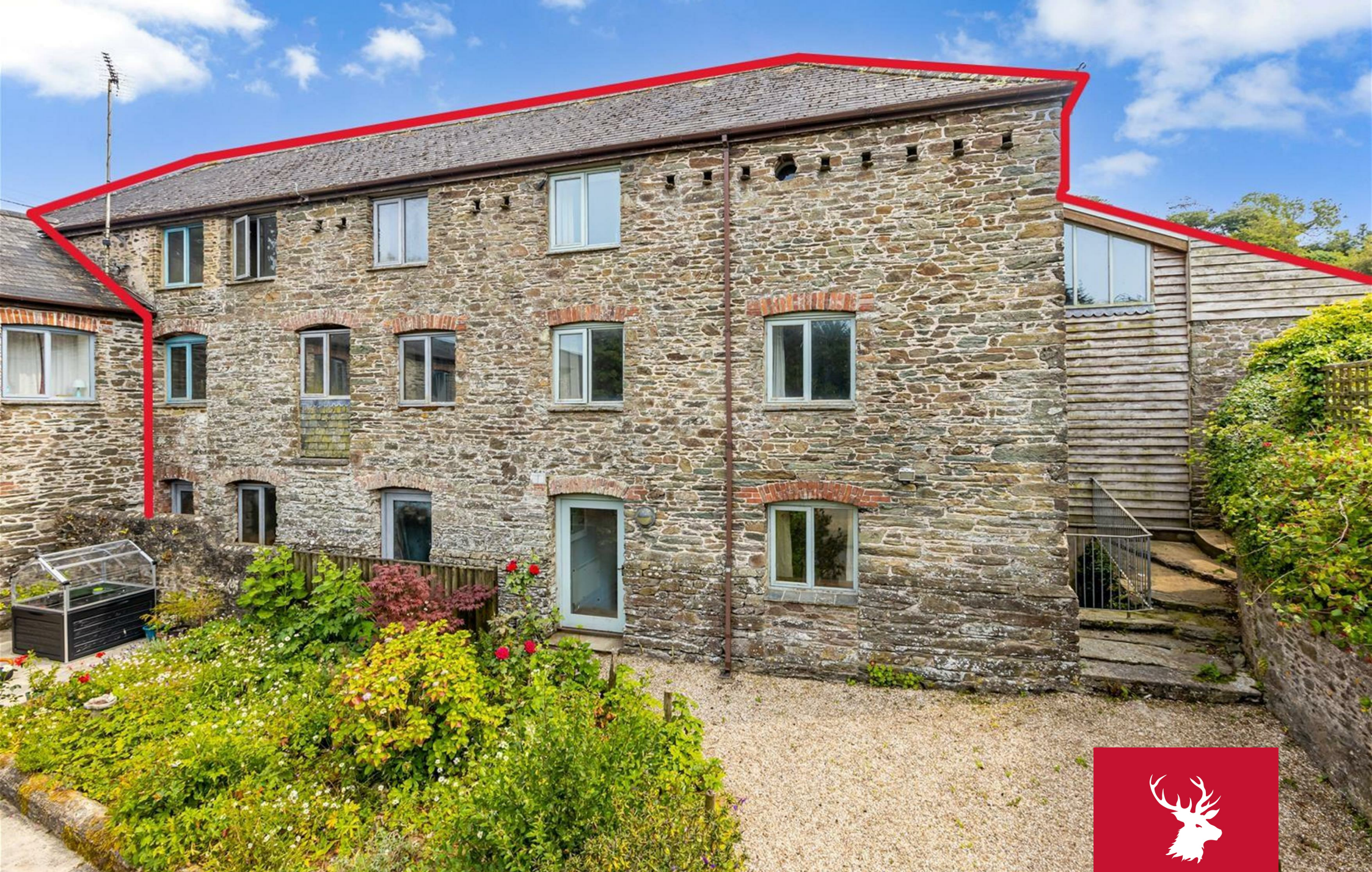
Corn Mill Barn,