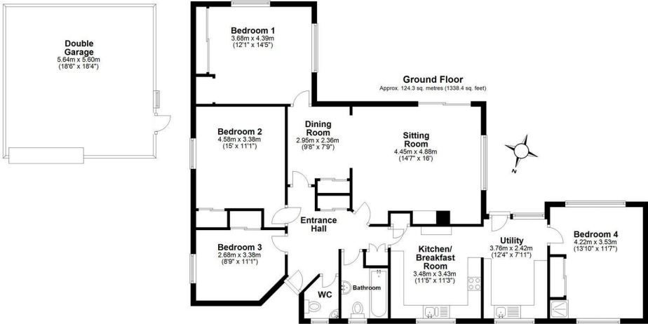
Total area: approx. 124.3 sq. metres (1338.4 sq. feet)