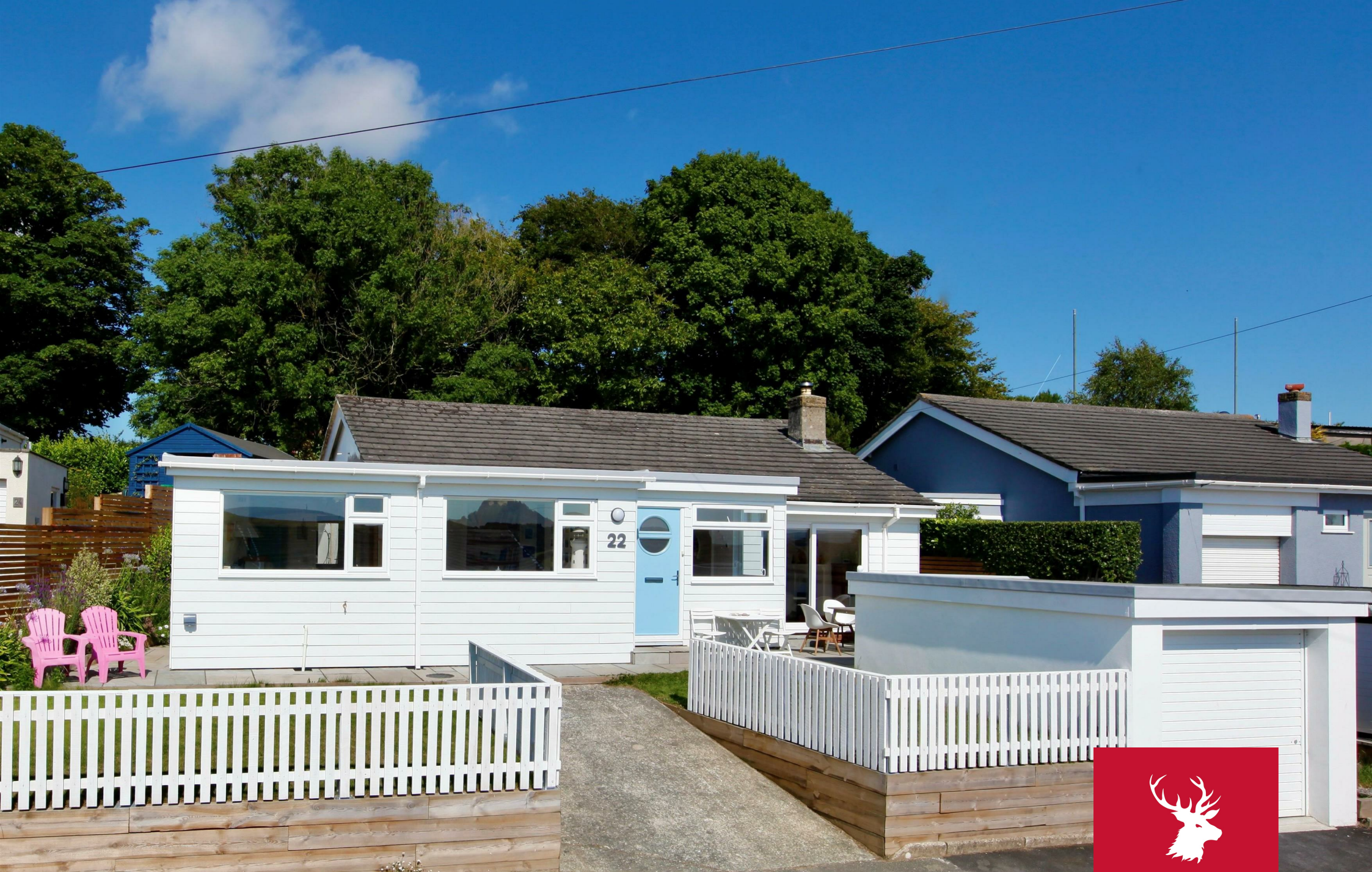
22, Barton Close