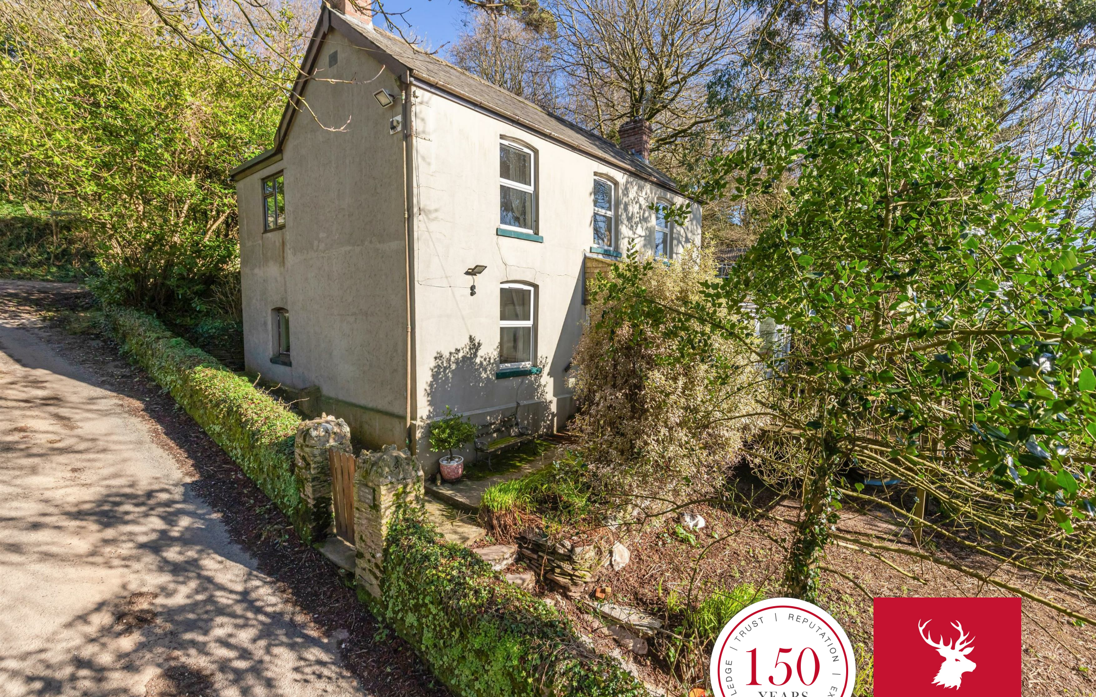
Higher Coltscombe Cottage