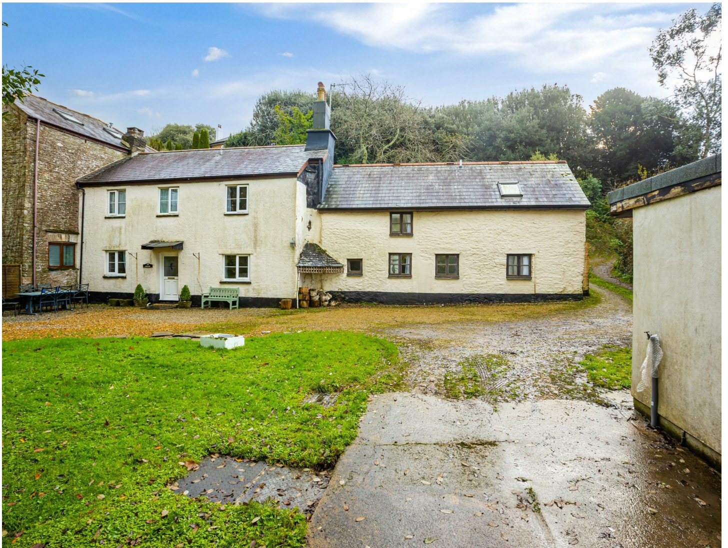
The Cottage & The Barn