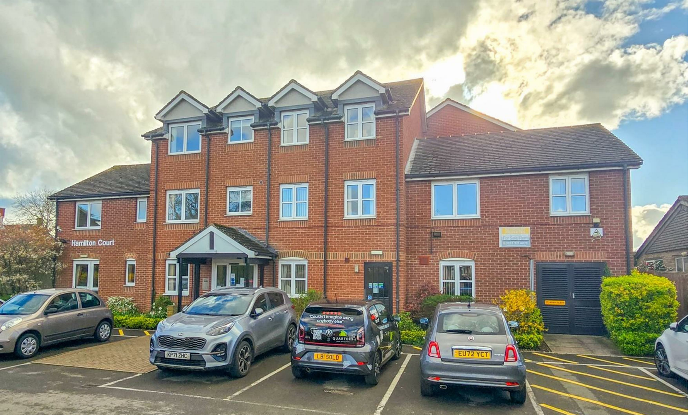
Hamilton Court, Lammas Walk Leighton Buzzard, LU7 1JF