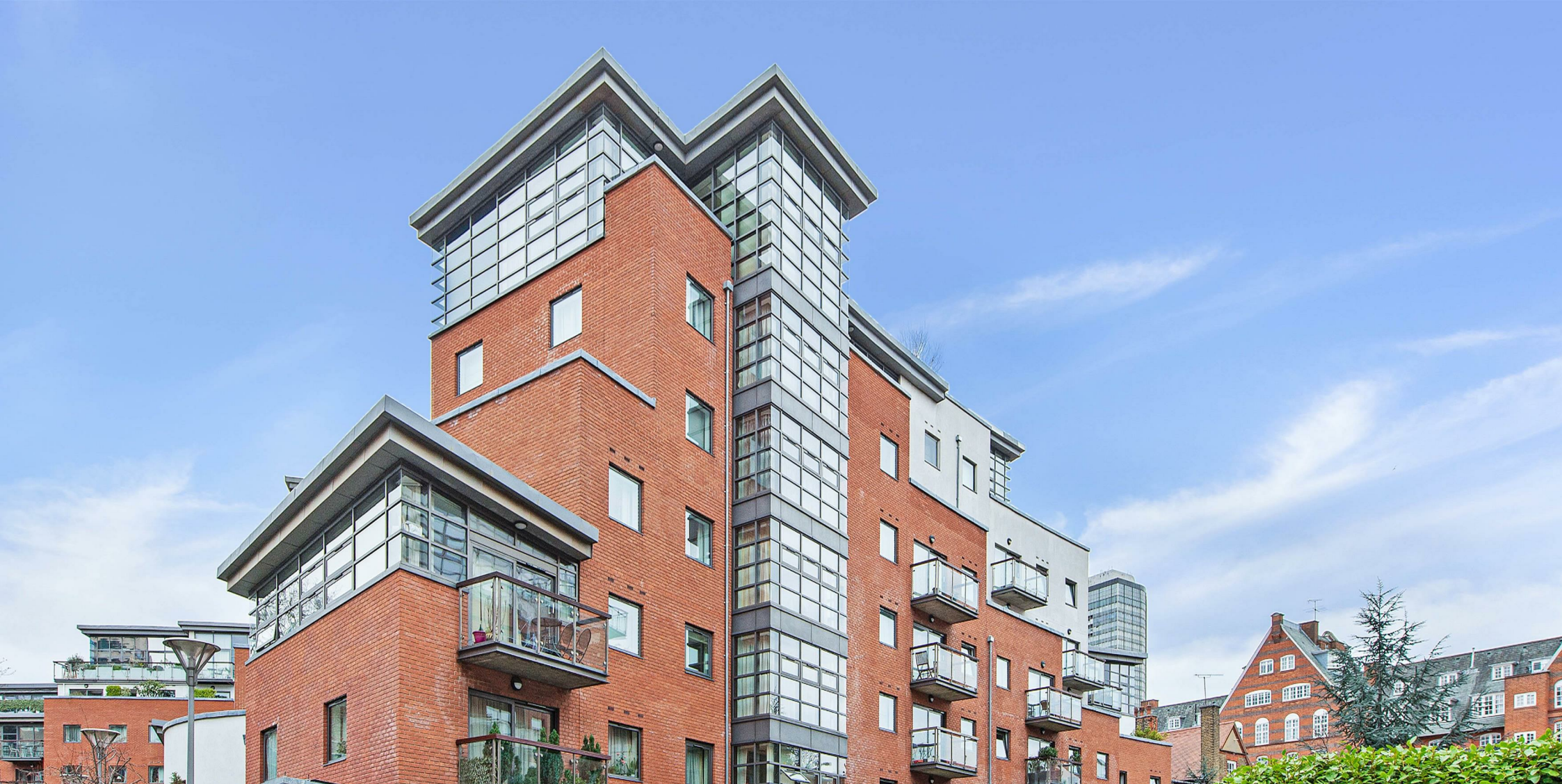
Montaigne Close, Westminster London SW1P