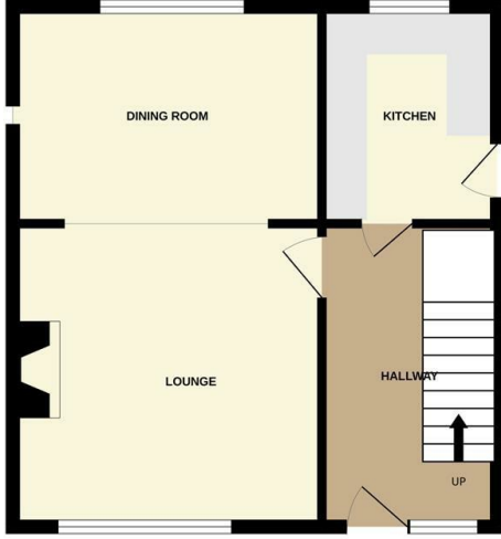
GROUND FLOOR 420 sq.ft. (39.0 sq.m.) approx.