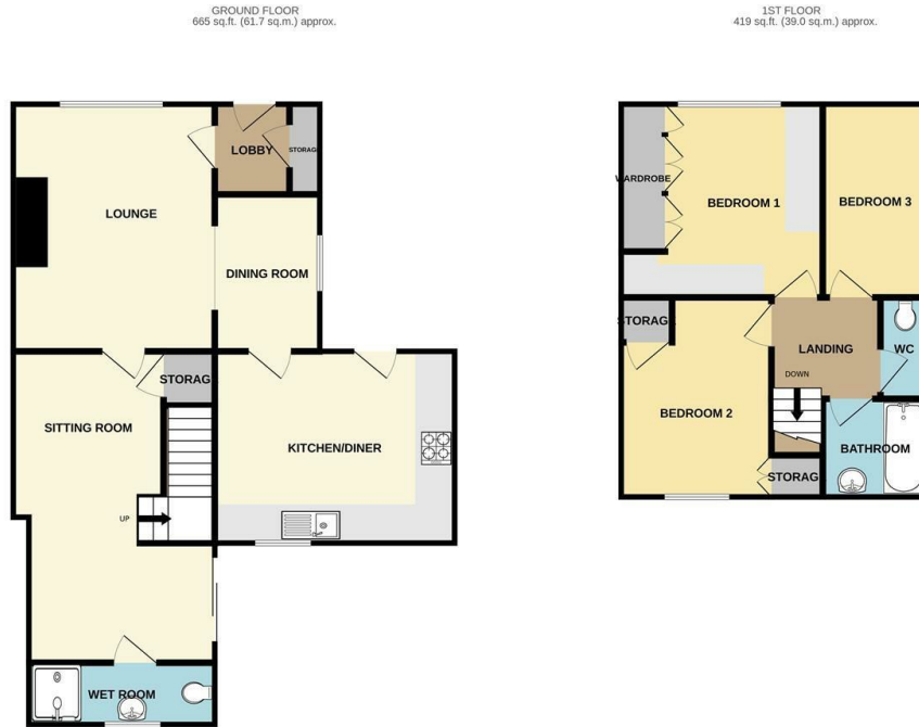
GROUND FLOOR 665 sq.ft. (61.7 sq.m.) approx.