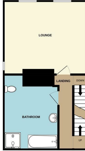
1ST FLOOR 393 sq.ft. (36.5 sq.m.) approx.