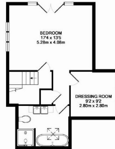
SOUTHWOOD AVENUE KINGSTON KT2 7HD TOTAL APPROX. FLOOR AREA 230.6 SQ. M. (2482 SQ.FT.)

All measurements taken to RICS Guidelines for Gross Internal Area. Whilst every attempt has been made to ensure the accuracy of the floor plan contained here, all measurements are approximate and no responsibility is taken for any error, omission or misstatement. This plan is for illustrative purposes only and should be used as such by any prospective purchaser. The services, systems and appliances shown have not been tested and no guarantee as to their operability or efficiency can be given.