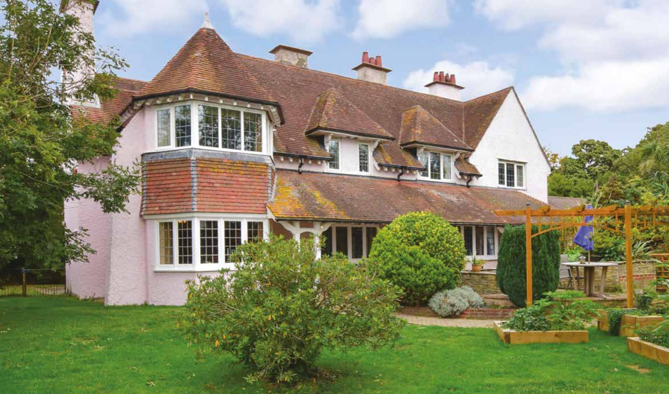
Crossways House Crossways Road | East Cowes | Isle of Wight | PO32 6LJ